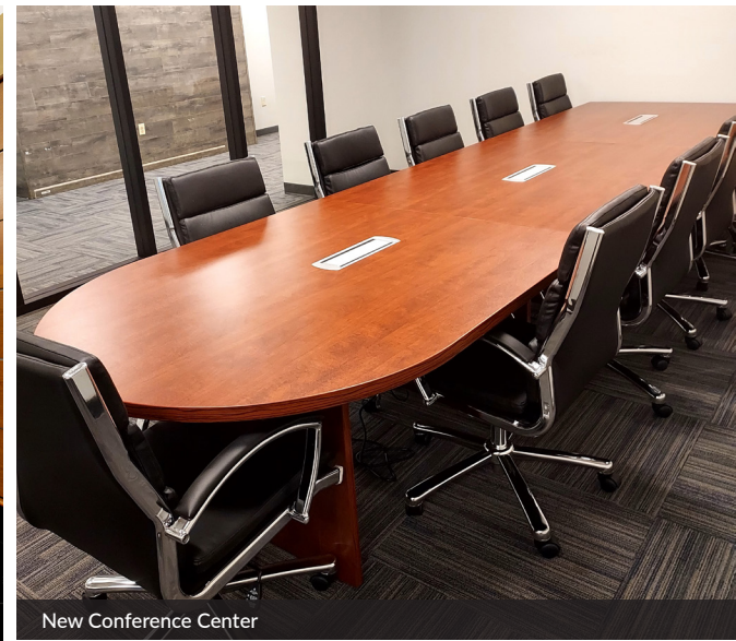
New Conference Center