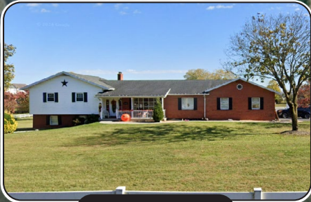
RESIDENCE: 3,510 SF