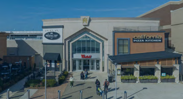
WESTFIELD ANNAPOLIS MALL