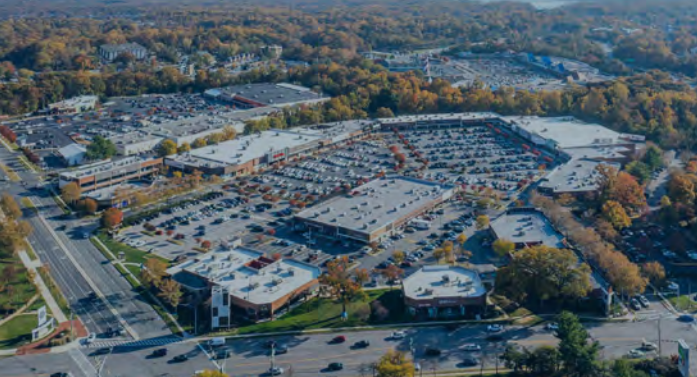
FESTIVAL AT RIVA ROAD