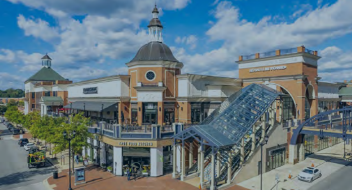
ANNAPOLIS TOWNE CENTRE